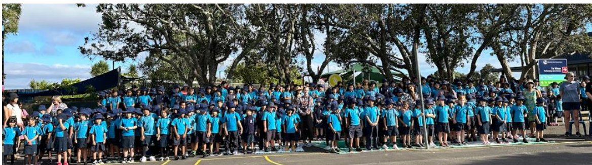
Welcome to our new families – We held a welcome Pōwhiri for them this morning.